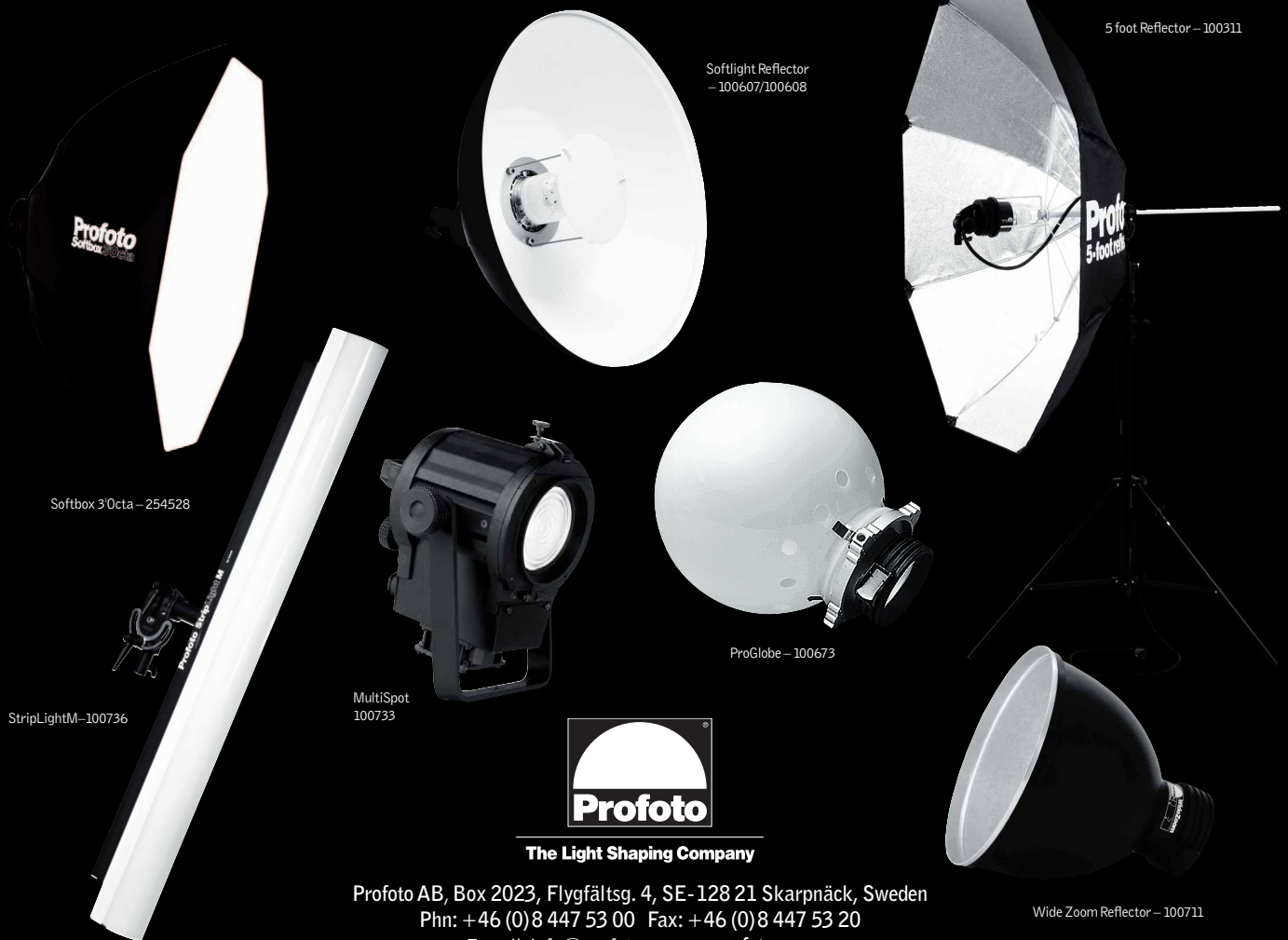
5 foot Reflector – 100311