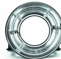
ProRing flash - 30 05 15

Working on location is always a challenge: There is not enough time. There is not enough space. There is not enough light. And worse: there is no electricity.